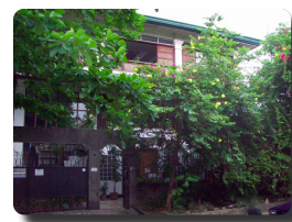
Isis International Women's House (Bahay ni Isis)

( http://accommodation.isiswomen.org/ ).